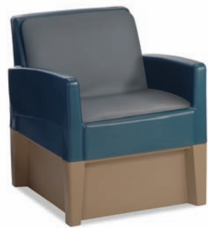
Molded Base Available in Fossil (shown) and Moss