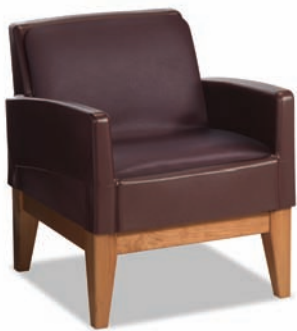
Wood Base Available in Walnut, Teak (shown) and Maple