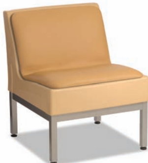
Steel Base Available in Metallic Silver