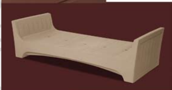
Attenda® Sleigh Bed