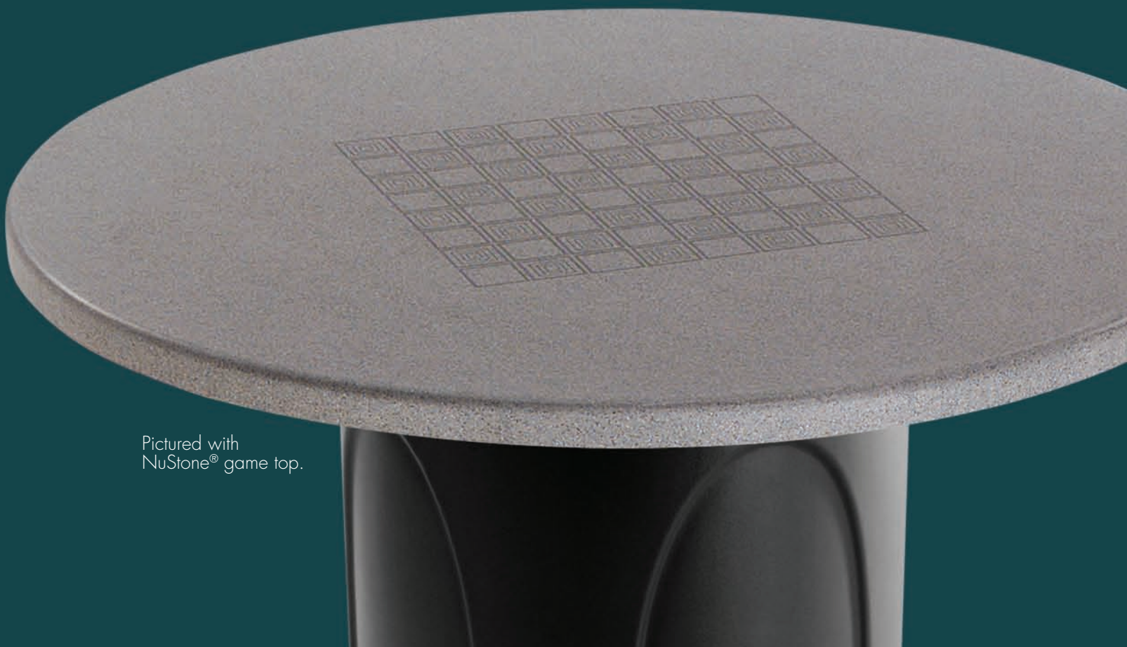
Pictured with NuStone® game top.