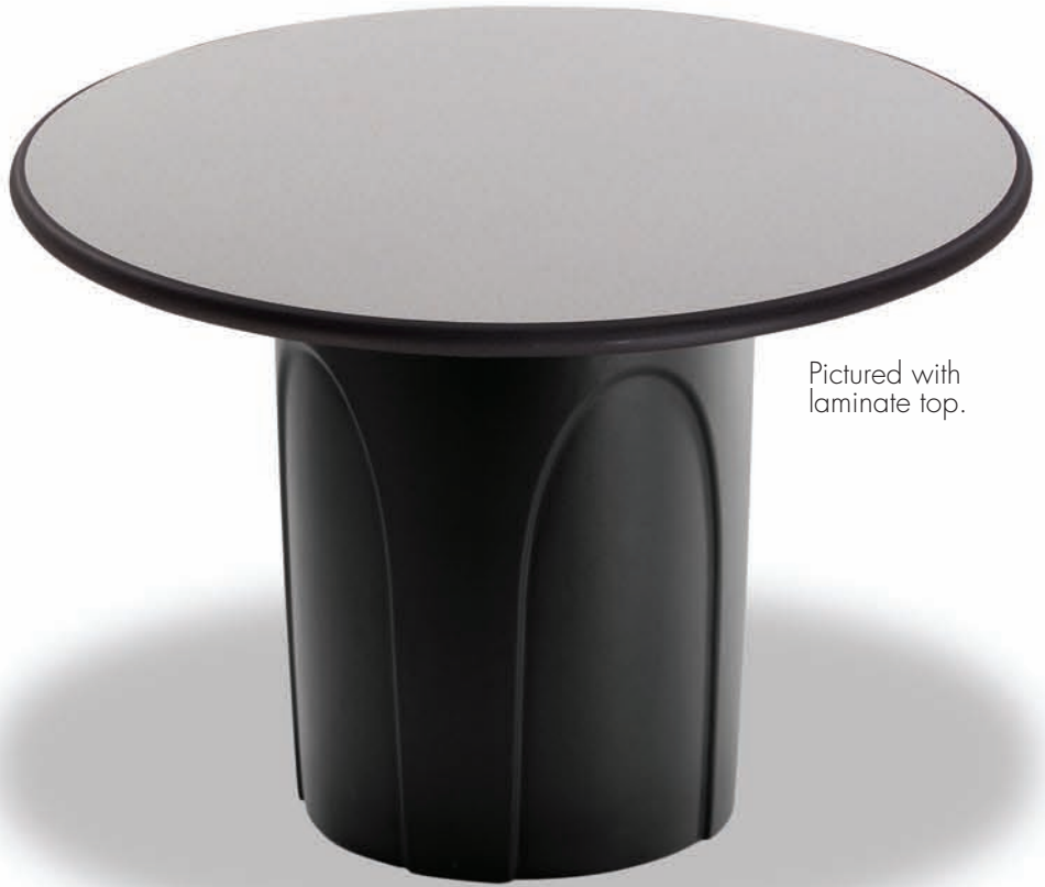
Pictured with laminate top.

Sometimes you want a table that is easy to move around. Other times, you'd like that table to stay in one place, but you don't want to bolt it to the floor. Enter the Norix Jupiter Table! Jupiter is designed to be ballasted on site to maintain space flexibility and allow for efficient floor maintenance as the needs of an environment change. Loading the base with up to 300 pounds of sand keeps the table solidly in one place. It can still be moved, but not hurled by staff.