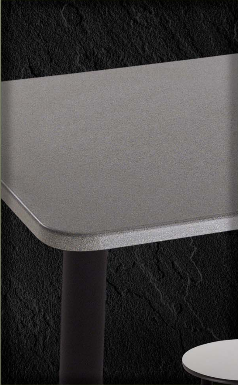
Leg Style Table