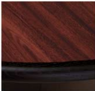
Versailles Mahogany Black Edge

Tops are available in six sizes and shapes, to suit your room layout. Choose from four natural wood-look laminates and two complementary edge colors – to coordinate with your room décor.