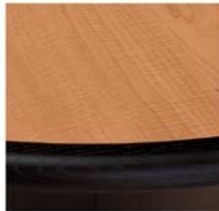
Monticello Maple Black Edge