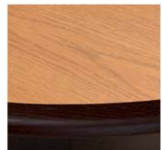
Solar Oak Mahogany Edge