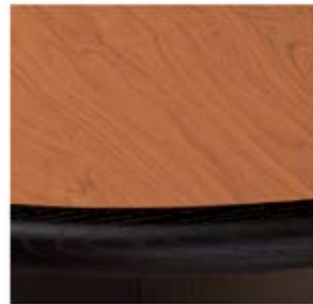
Wild Cherry Black Edge