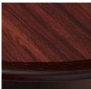
Versailles Mahogany Mahogany Edge