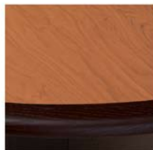
Wild Cherry Mahogany Edge