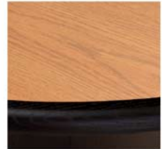
Solar Oak Black Edge