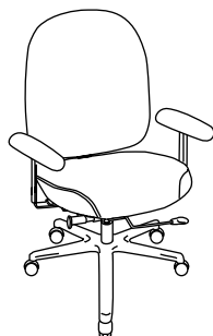
Model #: C188