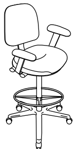
Model #: C185