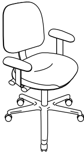
Model #: C182