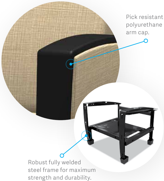
Pick resistant polyurethane arm cap.