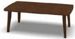
Model #HA2848 Harmony 28"x48" Rectangle Table