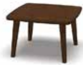
Model #HA2828 Harmony 28" Square Table

When it comes to healthcare and commercial facilities, options are paramount. Although Harmony's signature piece is its arm chair, the series also features sofas and love seats which – like the lounge chair – come with short or full aprons, and round or square backs. In addition, Harmony™ offers two and three seat benches, coffee and end tables that allow facilities to design a harmonious look in their spaces.