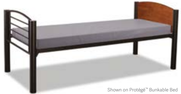
Shown on Protégé™ Bunkable Bed

11 oz/sq. ft. densified polyester fiber core is encased in a reinforced ripstop, fire-retardant, polyurethane coated cover with radio frequency welded seams for enhanced hygiene, security and durability. Premium cover is highly-puncture resistant and inhibits tearing if puncture does occur. Mattress is fluid, crack, peel, abrasion and bed bug resistant, anti-microbial and anti-fungal. Provides a virus barrier and is resistant to tearing and delaminating for greater infection control. Features a breathable vent that repels oil, water, blood, urine and other fluids. Core is made of non-hazardous materials.